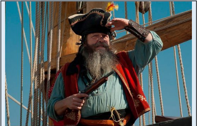
Massachusetts Institute of Technology (MIT) offers a "pirate certificate" to students who complete the archery, sailing, fencing, and pistol or rifle shooting courses.