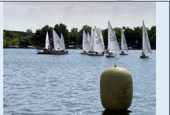
Laser action at last year's No Sweat Regatta

short competitors' meeting before racing begins at 11:00AM. Six short races will be attempted. The Notice of Race, with more details, is HERE .