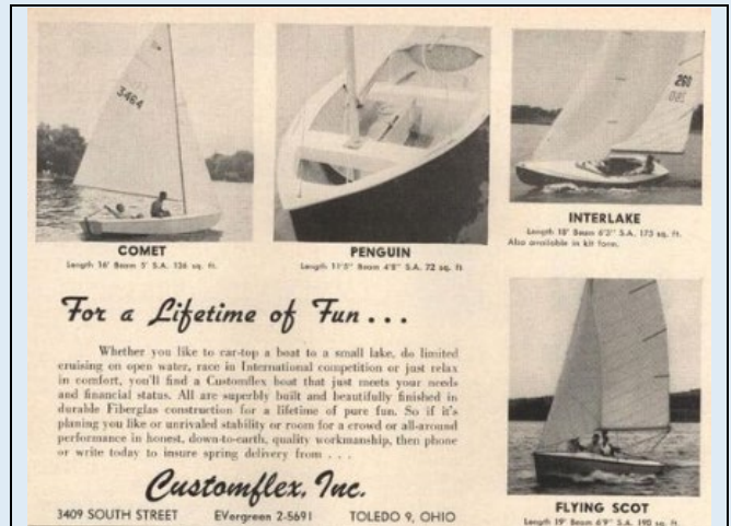
Photo of the Month