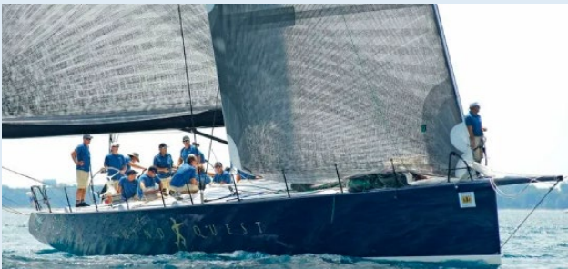
OC86 (formerly “Windquest”, holder of the Shore Course Record for the Bayview Mackinac Race

The race will start on Saturday July 20, from just north of the Bluewater Bridge in Port Huron. This year, all boats will race on the original 1925 course up the Michigan shoreline and leaving Bois Blanc island in the Straits of Mackinac to port. That course is 204 nautical miles and the record was set in 2021 by a crew from Oakcliff Sailing in New York at only a little more than 17 hours – they arrived at the finish line at 7:01 AM on Sunday morning after starting at 2:00 PM on Saturday afternoon.