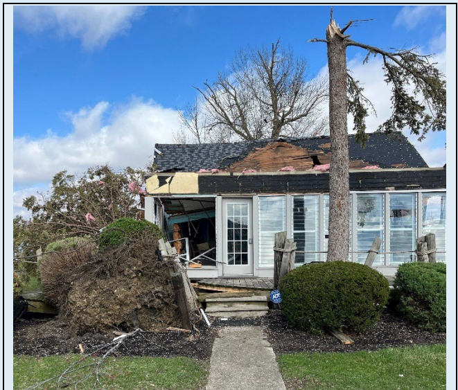
Indian Lake Yacht Club’s main club house, damaged by the tornado on 14-Mar.

The tornados that swept through central Ohio on Thursday 14-Mar caused three deaths. In addition, the storms did major damage to the Indian Lake Yacht Club, home of Interlake Fleet #10. The club was well insured and looks forward to being fully restored.