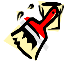
Paint the House