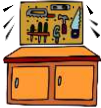
Clean the Garage